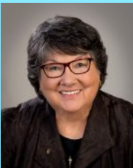
by Diane Cordero de Noriega District Governor 2019-20