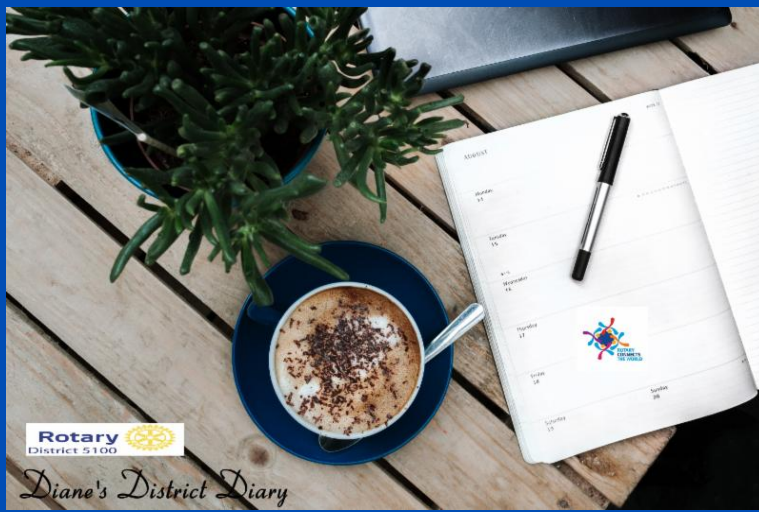
Rotary District 5100 Diane's District Diary