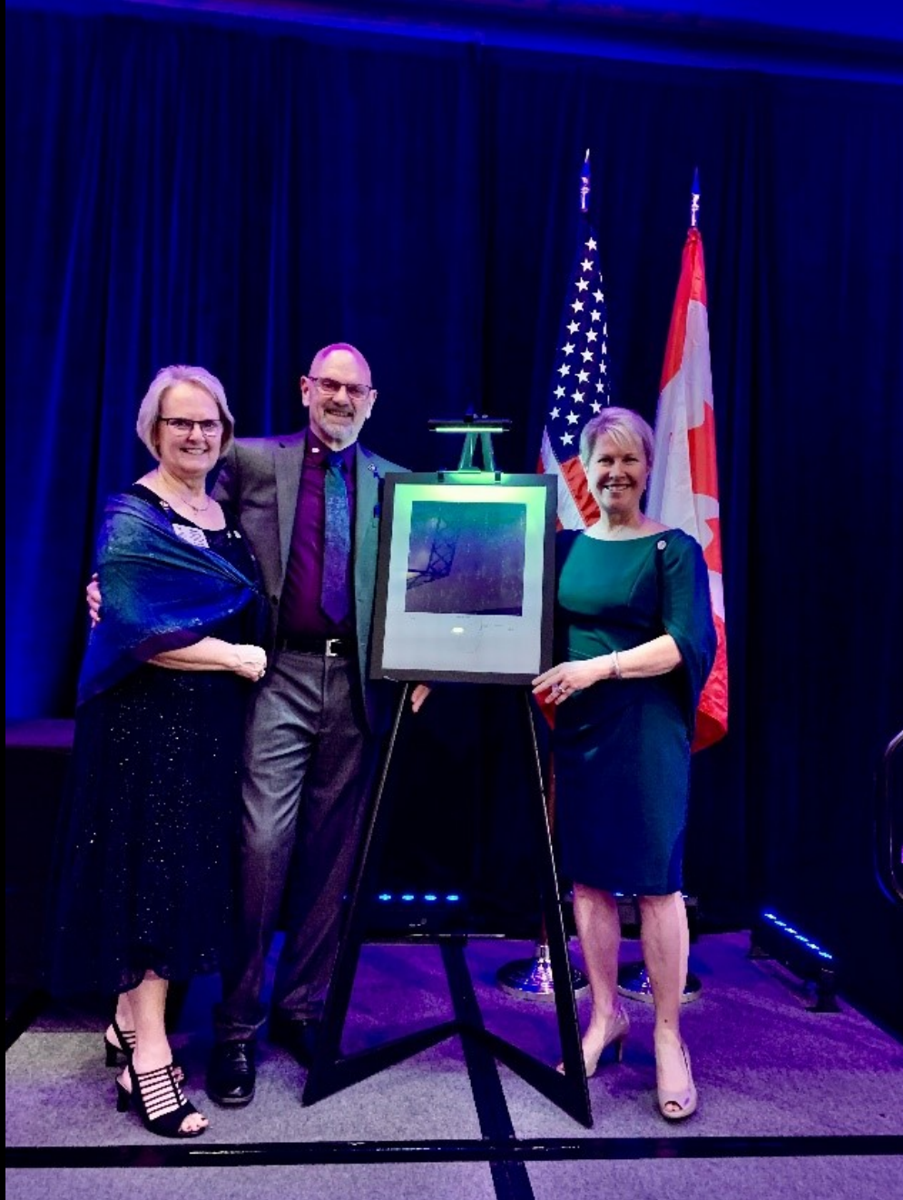
"Imagine One's Dreams".

Giving Tuesday is November 29. Donating is easy! Just click this link .